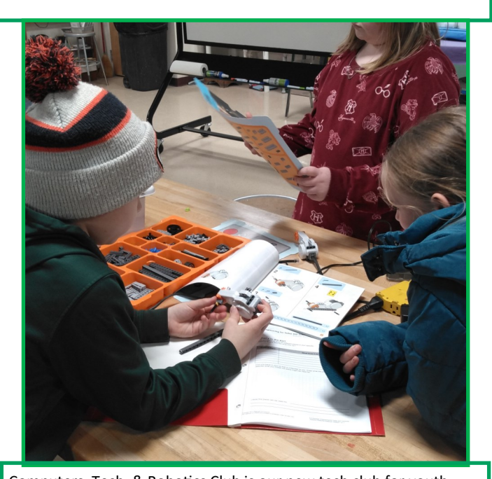
Computers, Tech, & Robotics Club is our new tech club for youth ages 8-12. This year they worked with computer programing, simple robotics, and other STEM challenges. With 12 active youth participating in this club, they had a lot of fun and look forward to next year.