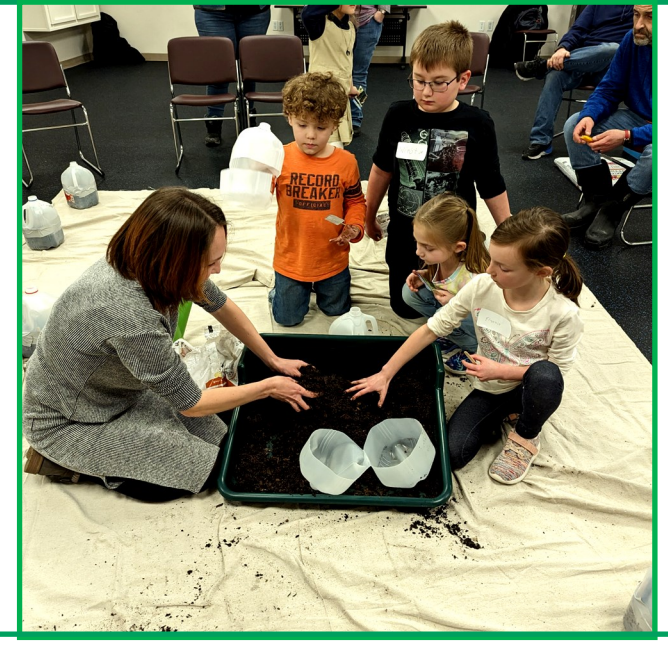
Little Buds & Sprouts was a short term gardening club for youth ages 5-12. There were 15 youth enrolled in this club, and we are looking for another volunteer who can continue to help lead this group in the future.

Our new Bike Club had 16 youth enrolled, with a core of 6 youth ages 8-12 who actively attended almost every club meeting. Youth enrolled in this club learned how to do bike maintenance and upkeep, bike safety, and rode their bikes around Cheboygan trails. This club donated several of the bikes that they fixed up to public programs like the Cheboygan Public Library and the local marina.