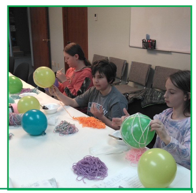
Arts & Crafts was a new short term club that had 11 youth enrolled ages 6-14. This was a test to see if there was enough interest in this type of club, and we hope to make this a permanent club in the future.