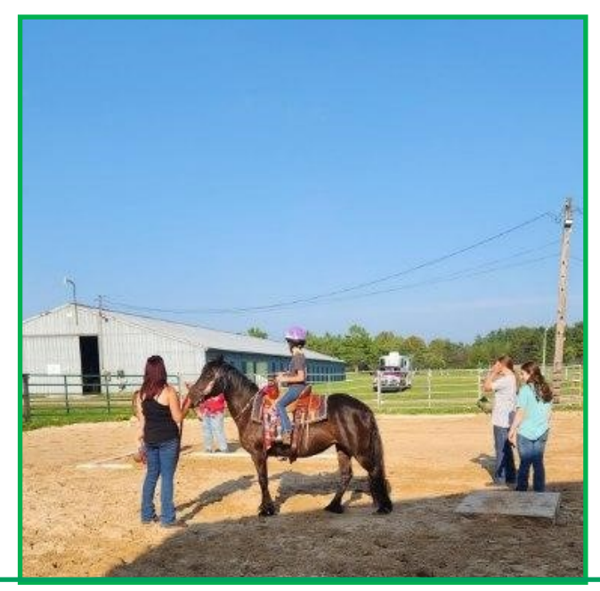
Mane Squeeze is our new horse club and had 6 youth enrolled ages 7-17. This year was the first year in a long time that we have had a 4-H horse show at fair, and we already have several more interested youth who would like to join next year.

One of our new animal clubs, the K9 Club had 10 members ages 9-16 this year and taught the youth and their dogs basic obedience commands, dog anatomy, health and nutrition, behavior modifications, first aid, agility, and much more. This club had a fun dog show at fair this year that generated even more interest and recruited more youth to the club.